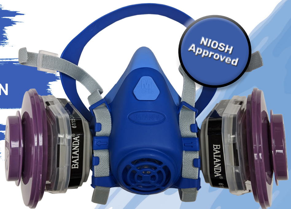
Particle Filter inside Filter Protector