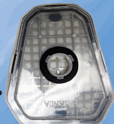
Installed Cartridge Connector

“Very few replacement parts and super-simple disassembly make cleaning and maintaining the Respirator easy.”